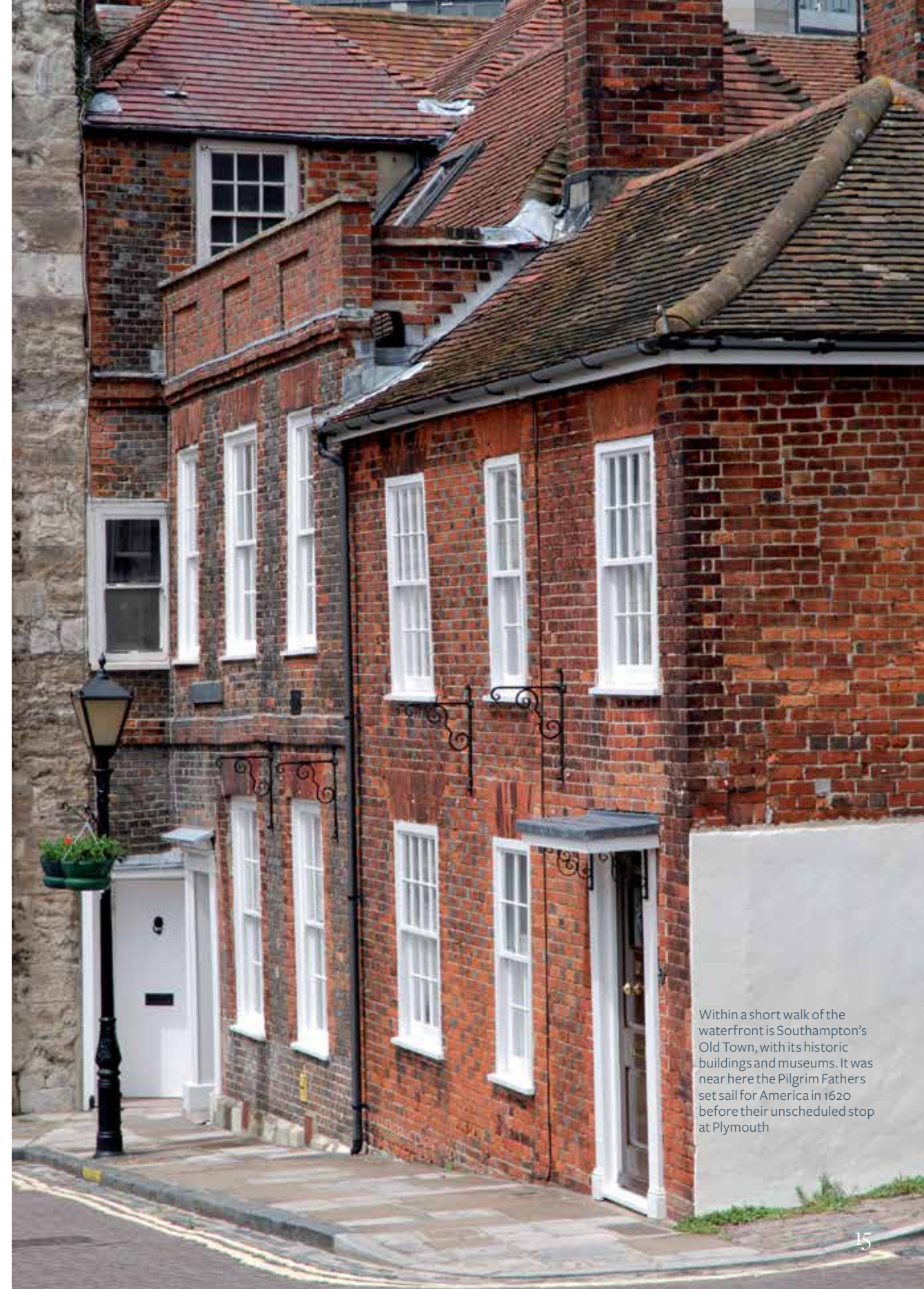
Within a short walk of the waterfront is Southampton's Old Town, with its historic buildings and museums. It was near here the Pilgrim Fathers set sail for America in 1620 before their unscheduled stop at Plymouth

Southampton has a rich maritime heritage so it is unsurprising that today there is growing interest in water sports, sailing and ocean racing. For more information and a short video please visit: www.southampton.ac.uk/visitus/cityandregion