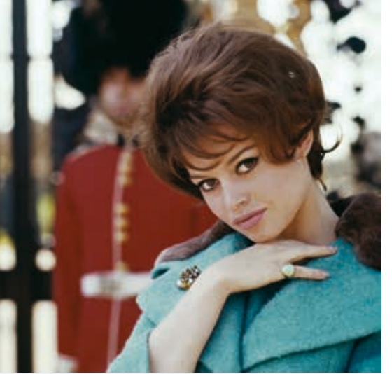
Bardot in London