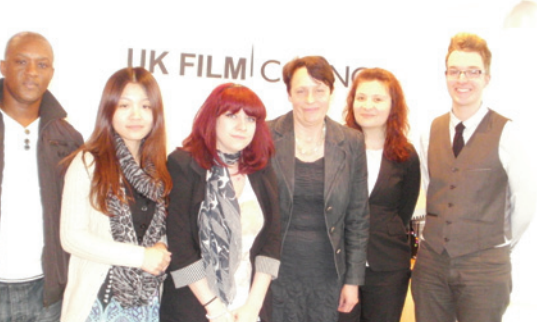
Group at UKFC offices