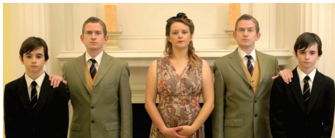
Still from The Laytons