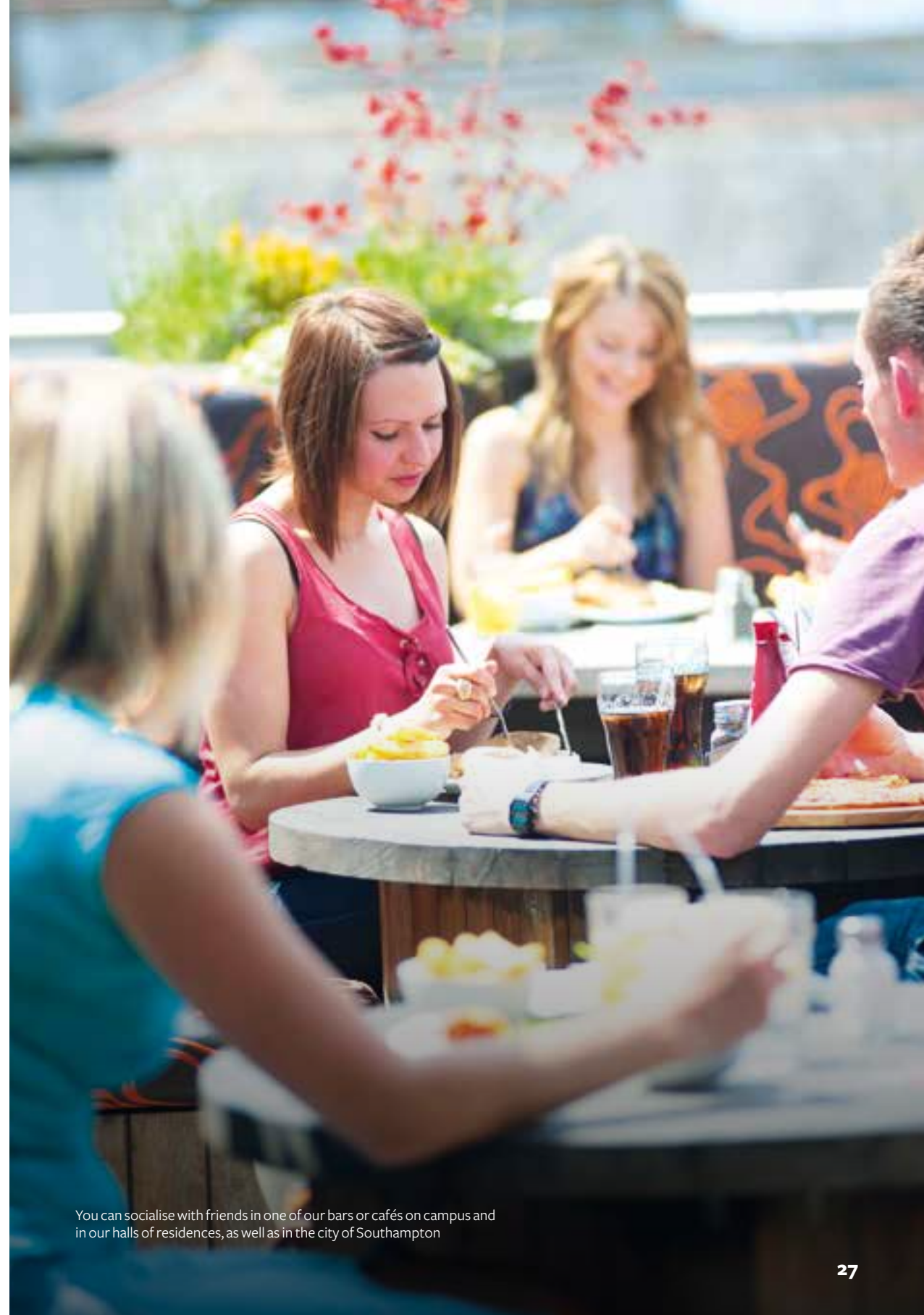
You can socialise with friends in one of our bars or cafés on campus and in our halls of residences, as well as in the city of Southampton

University Residences Tel: +44 (0)23 8059 5959 Email: accommodation@southampton.ac.uk www.southampton.ac.uk/accommodation