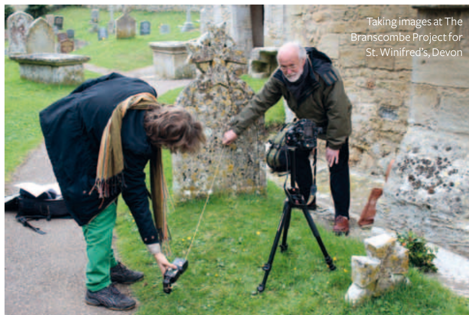
Taking images at The Branscombe Project for St. Winifred's, Devon