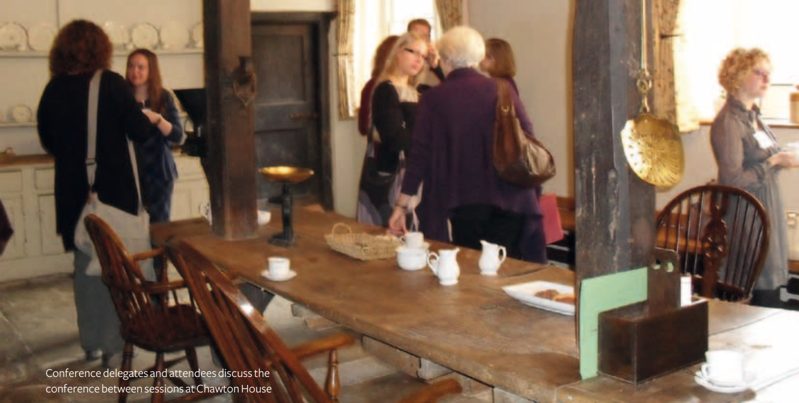
Conference delegates and attendees discuss the conference between sessions at Chawton House