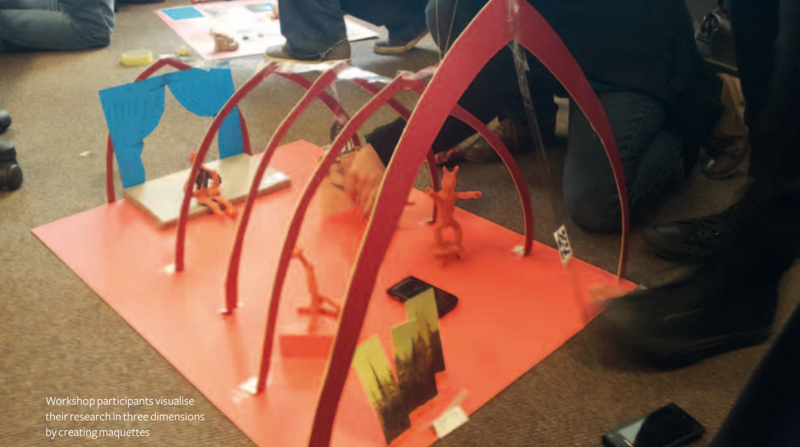
Workshop participants visualise their research in three dimensions by creating maquettes