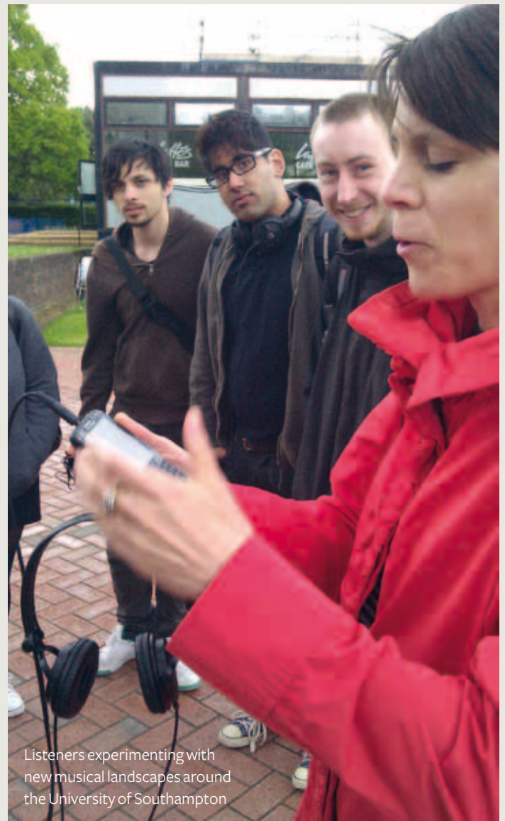
Listeners experimenting with new musical landscapes around the University of Southampton