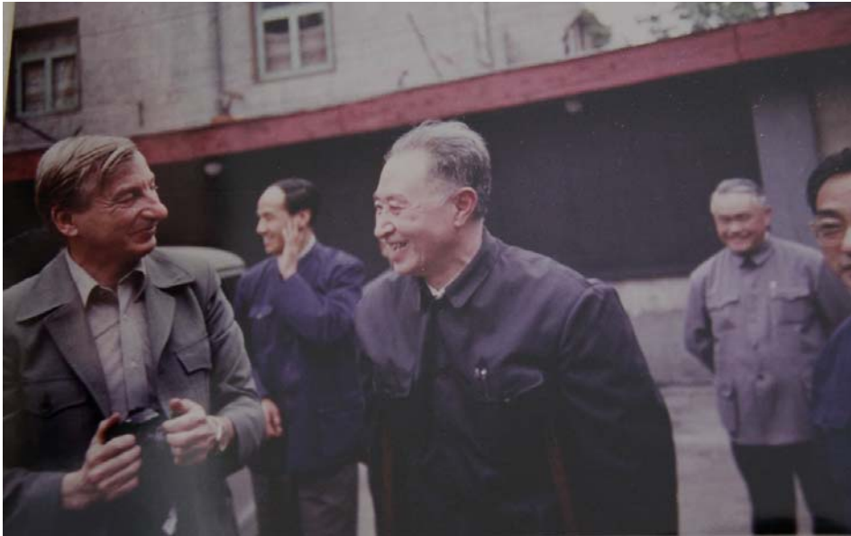
First UK science delegation to China