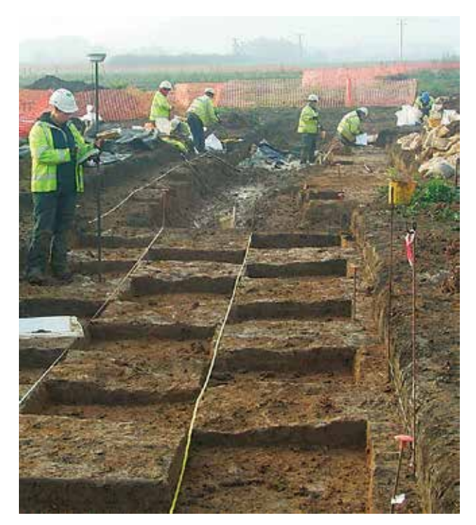
Excavation of the flint scatters.