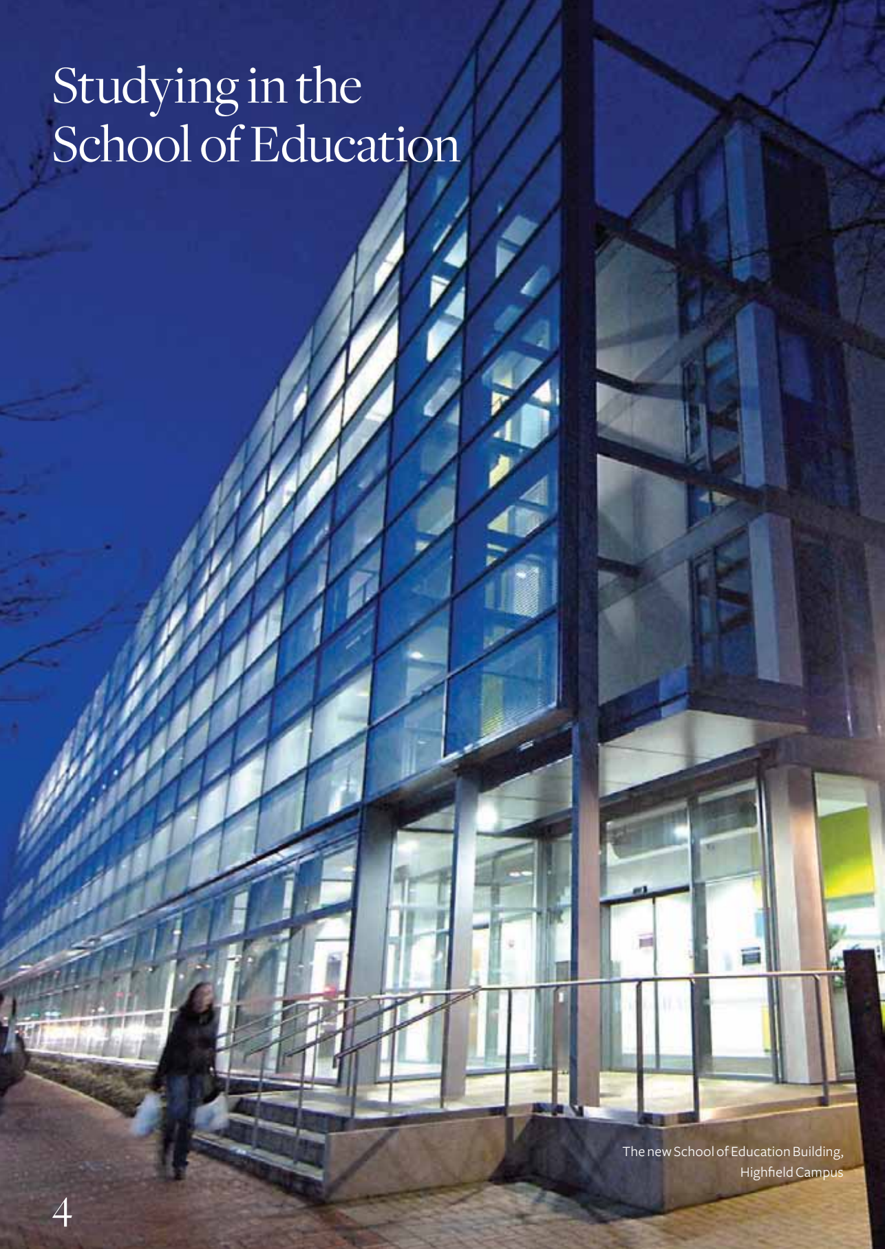
The new School of Education Building, Highfield Campus

Programme structures: the majority our programmes consist of a set of taught modules assessed by coursework plus a final dissertation. To support your progression there are a series of dissertation studies sessions which provide you with the opportunity to approach your research in a structured way. These sessions are designed to develop study skills and a suitable plan for your independent inquiry.