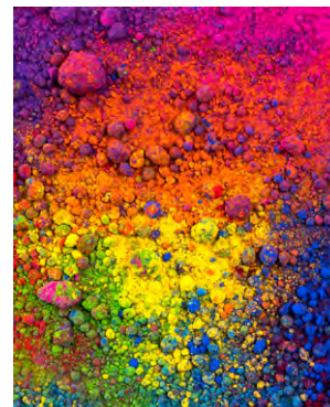
Modern Languages and Linguistics