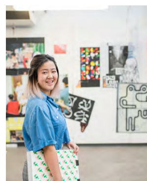
Winchester School of Art