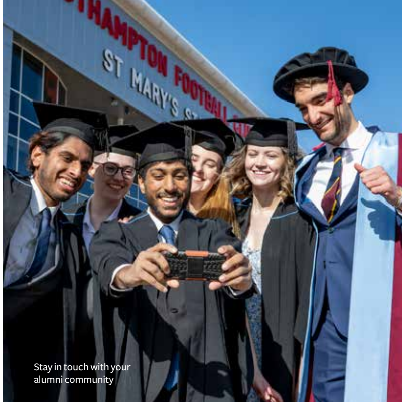
Stay in touch with your alumni community

As a graduate of the University of Southampton, you are now part of a global community of more than 265,000 alumni spanning 180 countries. This network of talented people has one thing in common, a shared connection that can help open doors, build relationships, and shape your future as you go out into the world.