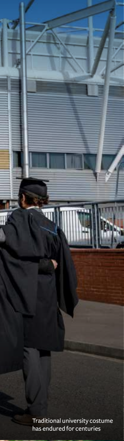
Traditional university costume has endured for centuries