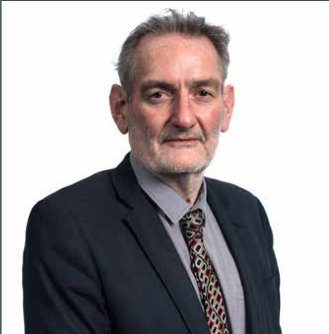
Professor Sir Ian Diamond DL FRSE FBA FAcSS Doctor of Science

Since August 2018, Sir Ian has been the National Statistician and Permanent Secretary of the Office for National Statistics.