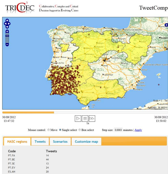
Figure 2: GeoServer real-time visualization of tweet activity

Our dataset consists of tweets about two events gathered by use of the Twitter Streaming API to track a list of keywords. The annotation task (i.e. the classification of the events) was jointly carried out by two annotators.