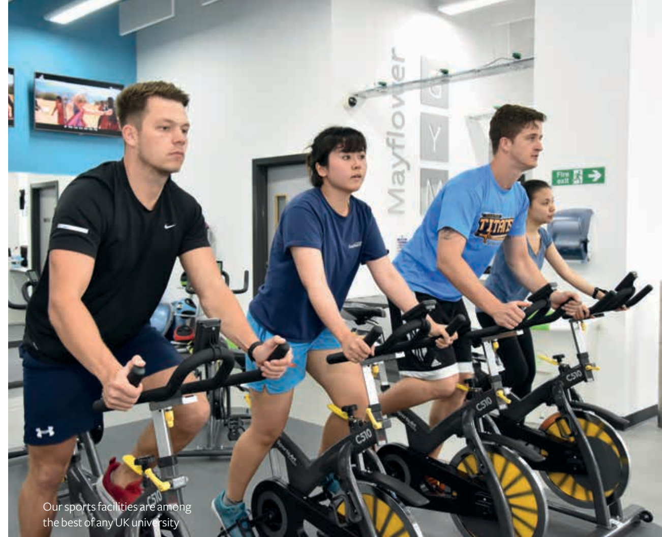
Our sports facilities are among the best of any UK university