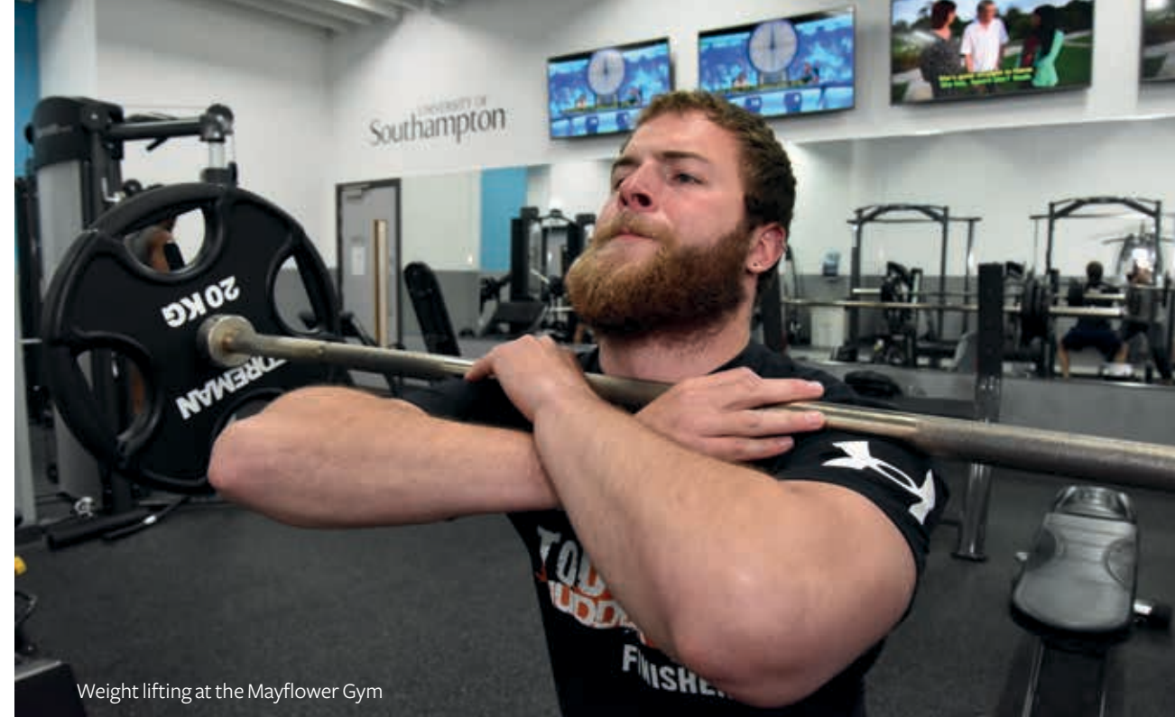
Weight lifting at the Mayflower Gym

Our Membership Scheme includes access to the sports facilities, details can be found on pages 16/17. Courts, pitches and courses must be booked in advance. Terms and Conditions can be found on our website.