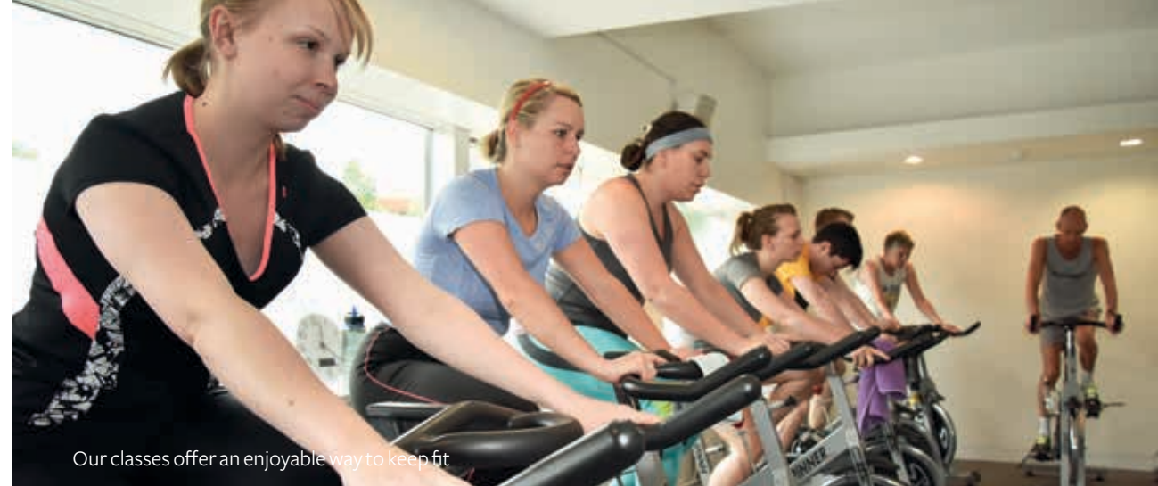
Our classes offer an enjoyable way to keep fit

A friendly, informal consultation will highlight your strengths and weaknesses and an exercise programme will be designed for your own personal benefit with a follow-up practical session in the gym.