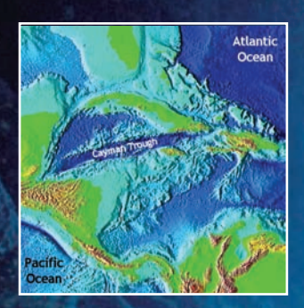
Into the Abyss: the expedition will visit the Cayman Trough

Scientists at NOCS are set to explore the world's deepest undersea volcanoes and find out what lives in a 'lost world' five kilometres beneath the Caribbean.