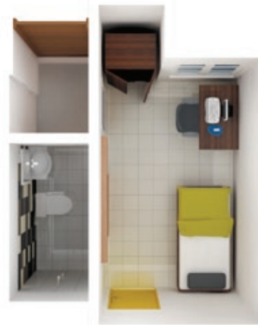
Single Ensuite (198 sq. ft.)