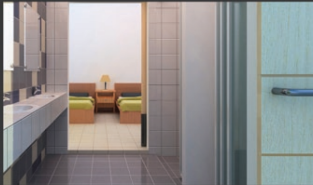
4-sharing room: View from bathroom