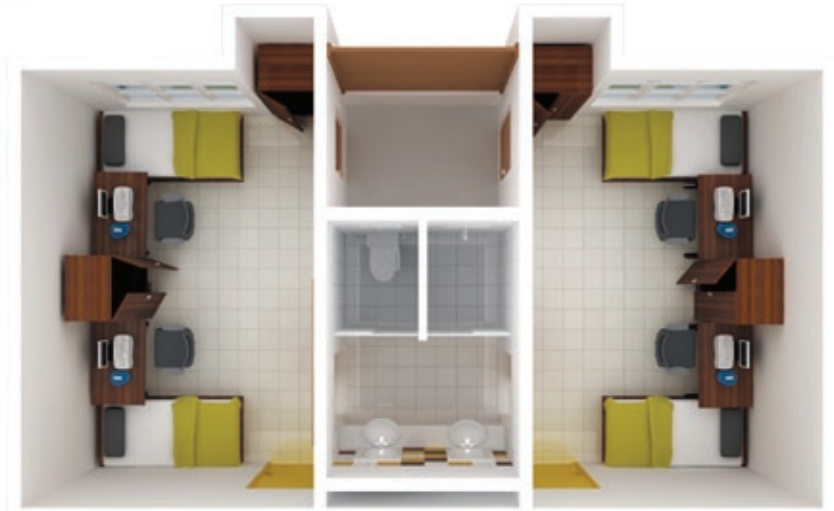
4-sharing (552 sq. ft.)