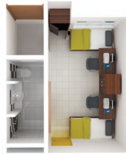
Twin-sharing (283 sq. ft.)