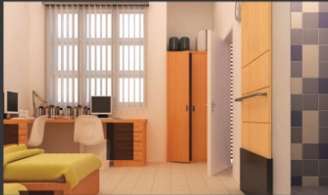
Twin-sharing room: View from entrance door