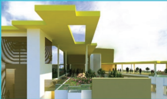
Roof Terrace Garden