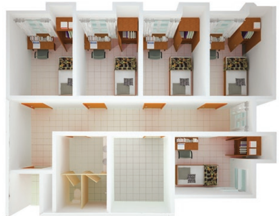
5-sharing (857 sq. ft.)