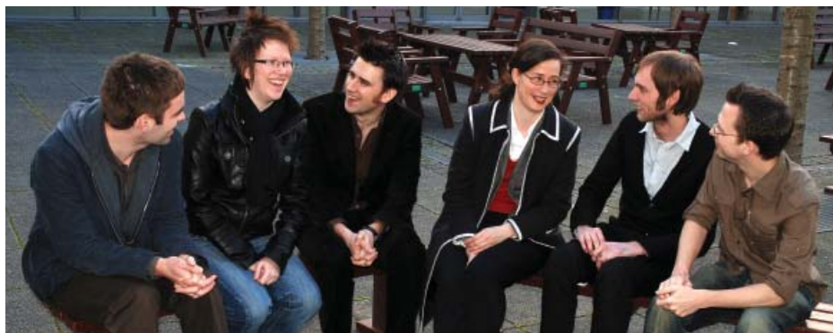
Alumni speakers share memories of their Undergraduate days at the University of Southampton

Look out for a full feature on the event in the next issue of Newsreel.