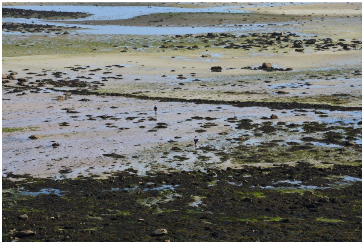
Samson Flats submerged prehistoric field system, Isles of Scilly, UK.