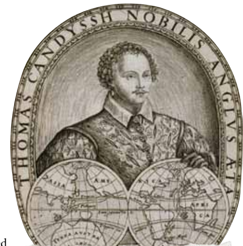
Jodocus Hondius's c1590–92 engraving of Thomas Cavendish, explorer and privateer. Cavendish was one of a distinguished band of adventurers – including the legendary medieval Welsh prince Madoc – to be celebrated in The Principal Navigations

But perhaps his most important contribution to Jacobean exploration was through the advice and experience he could offer to new generations of explorers