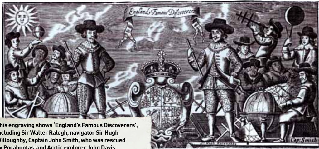
This engraving shows 'England's Famous Discoverers', including Sir Walter Raleigh, navigator Sir Hugh Willoughby, Captain John Smith, who was rescued by Pocahontas, and Arctic explorer John Davis