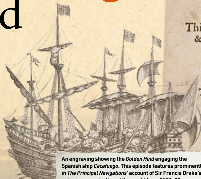
An engraving showing the Golden Hind engaging the Spanish ship Cacafuego . This episode features prominently in The Principal Navigations' account of Sir Francis Drake's epic circumnavigation of the world from 1577-80