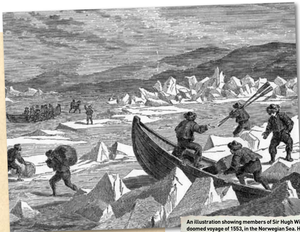
An illustration showing members of Sir Hugh Willoughby's doomed voyage of 1553, in the Norwegian Sea. Hakluyt's understated reference to the crew's demise served to encourage readers to imagine the agony of their final days