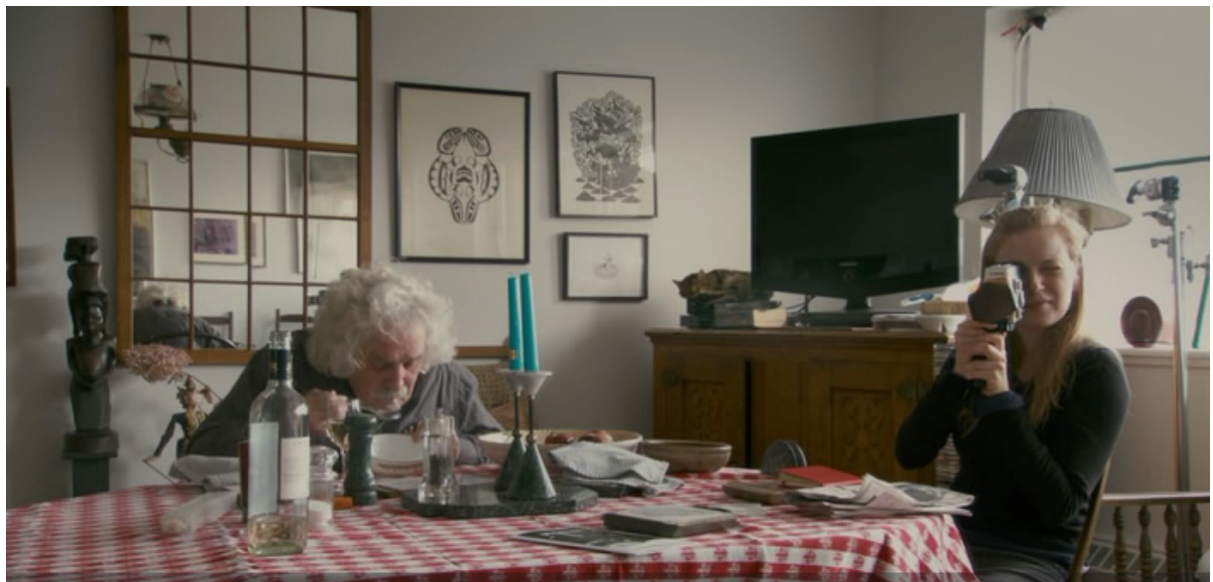
Figure 1: Still from Stories We Tell