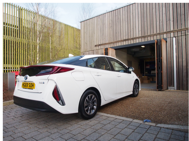
TRG Instrumented Vehicle (IV3)

The IV3 and an instrumented bicycle (iBike) for on-road trials, are hosted in the garage facility in Building 185 at Boldrewood.