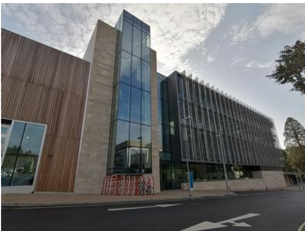
National Infrastructure Laboratory at Boldrewood