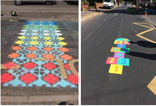
Example measures and activities implemented as part of Metamorphosis to create child-friendly neighbourhoods

UKCRIC Strand C: Data Analytics Facility for National Infrastructure (DAFNI) (EPSRC from April 2017 to March 2021). Contract Holder: Dr S.P. Blainey, jointly with eleven other universities.