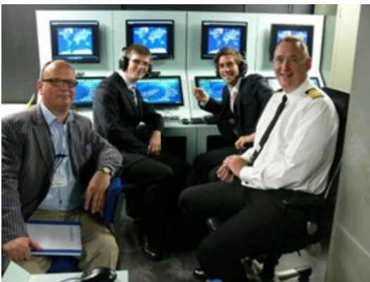
The ComTET Submarine Control Room Simulator