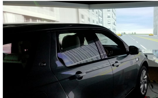
The Southampton University Driving Simulator (Mark 2)