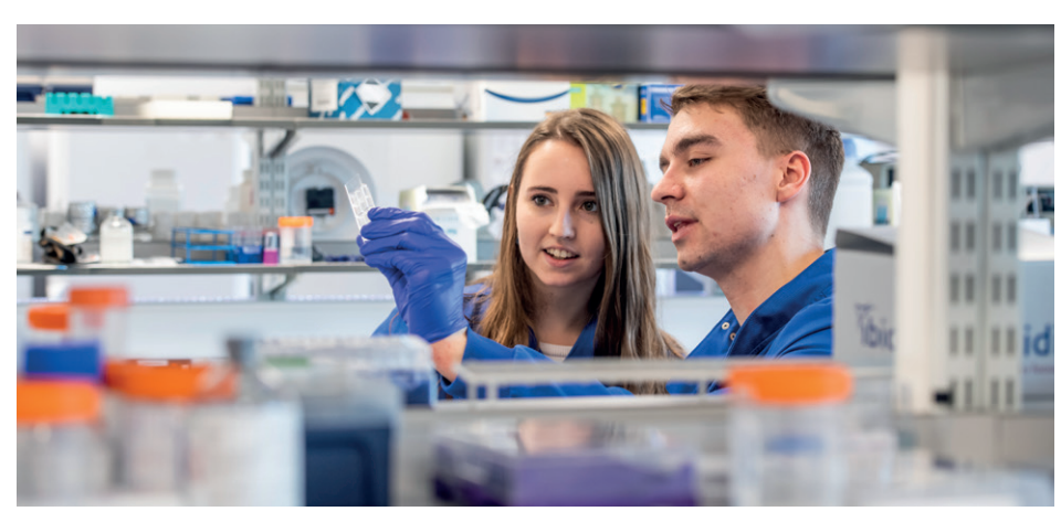
Scientists in the UK's first Centre for Cancer Immunology, fully funded through philanthropy.