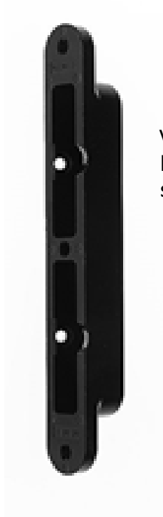
VS4000 box strike