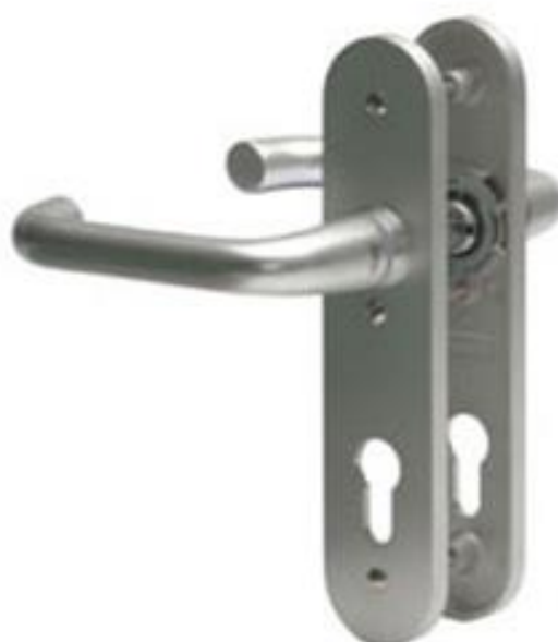
NEMEF 3253 Aluminium door furniture 72 mm