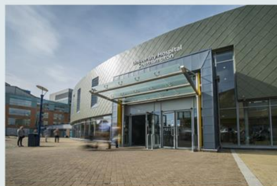
University Hospital Southampton