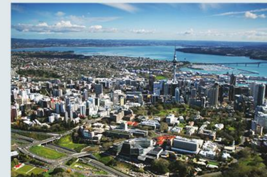
City Centre Campus